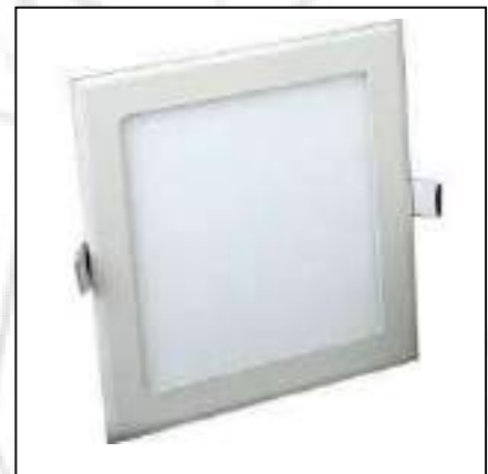
POP Light( Round/Square)