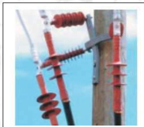
Medium Voltage Termination