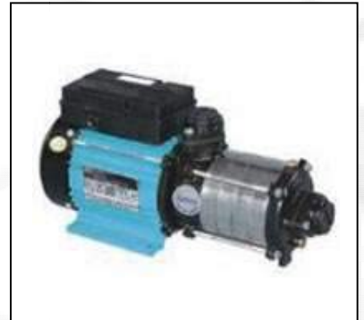
Horizontal Multistage Pump