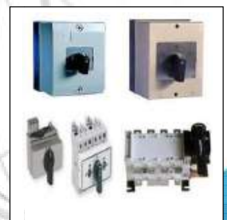
Change Over Switch