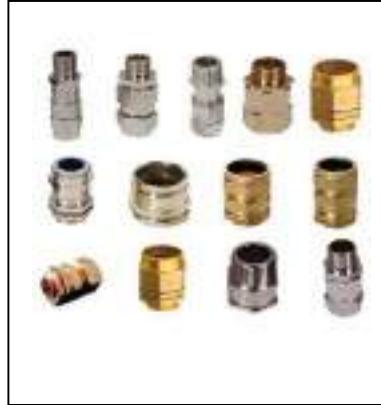
Brass Cable Gland