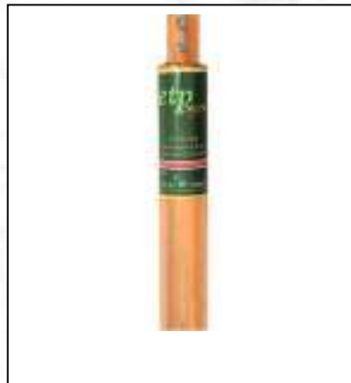
Copper Coated Earthing Electrode