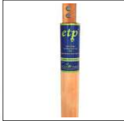
Flat in Pipe Coated Earthing