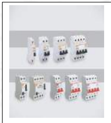
Earth Leakage CB