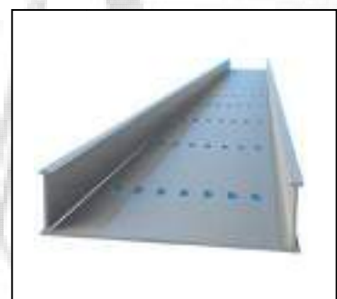
FRP Cable Tray