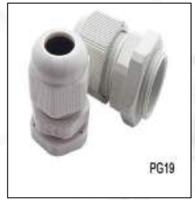
PG Cable Gland