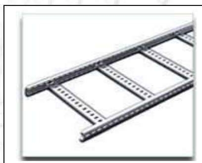
Ladder Type Cable tray