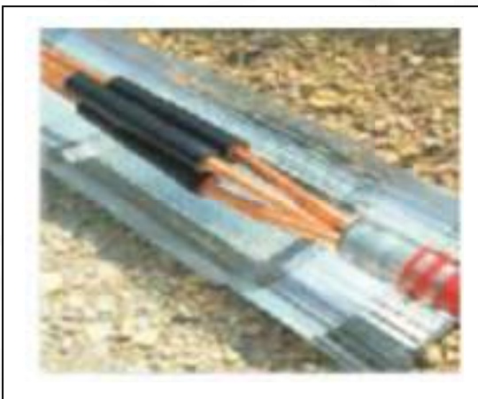
Medium Voltage Joints