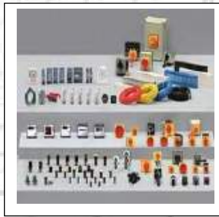
Panel Board Accessories