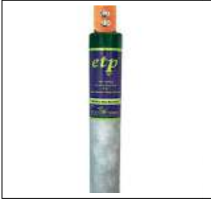
Hot Dip GI Earthing Rod