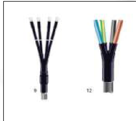
Low Voltage Termination