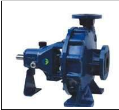
End Suction Pump