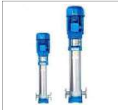
Vertical Multistage Pump