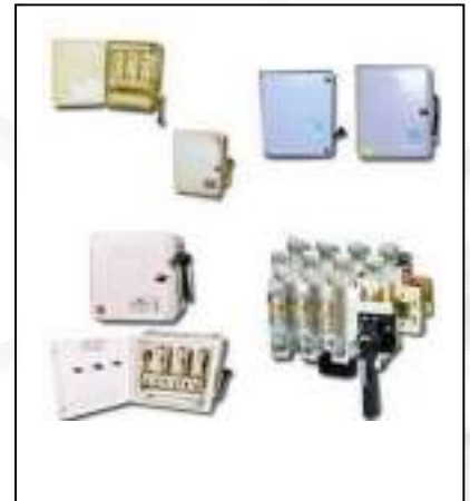
Switch Fuse Unit