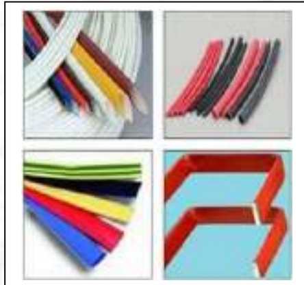
Heat Shrink Sleeves