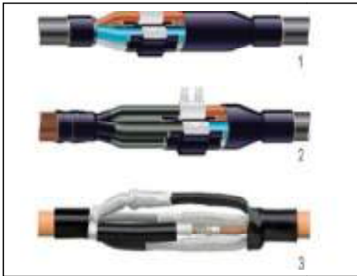
Low Voltage Joints