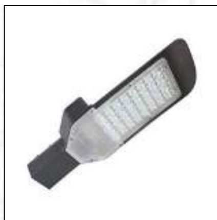
LED Street light (Lens Model)