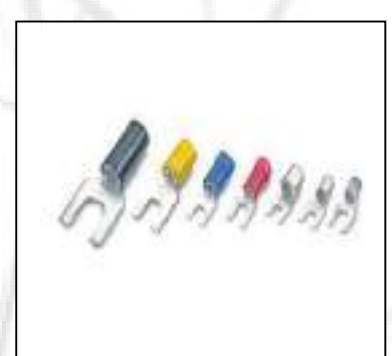
Fork type Lug