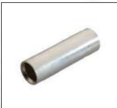
Inline Connector Lug