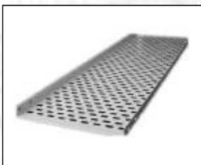
Perforated Cable Tray

Finishing: Hot-Dip G.I , Electro Plating G.I , Powder Coated , Painted.