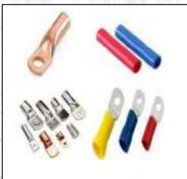
Tubular Type Lug