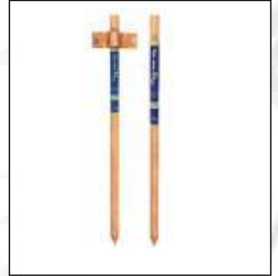
Copper Solid Rod