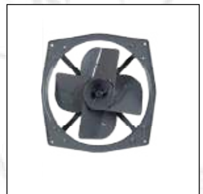
Heavy Duty Exhaust Fan Single Phase