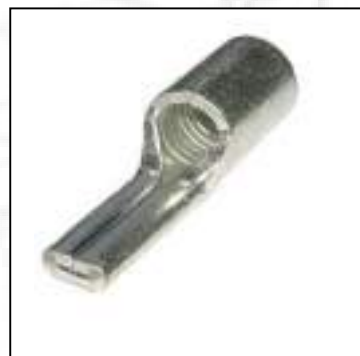
Pin type Lug