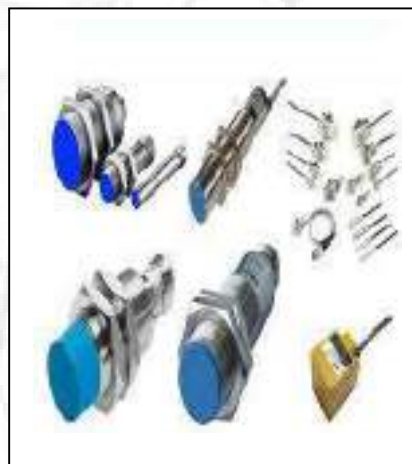
Types of Proximity Switch