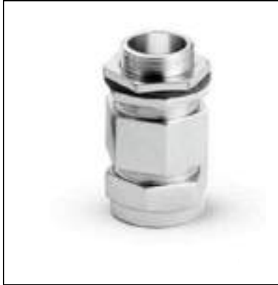
Double Compression Cable Gland