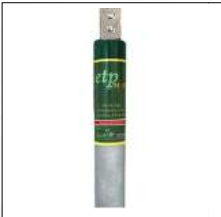
GI Pipe Earthing Flat Electrode